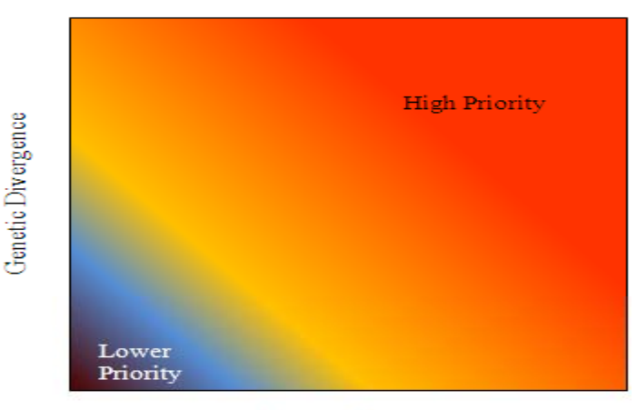
Adaptive Divergence Adapted from Moritz 2002

Figure 3. Craig Mortiz suggested that the continuous nature of genetic and adaptive divergence required that these two characteristics be jointly considered in the prioritization of population for conservation. Entities with the highest priority are those showing marked neutral genetic and adaptive divergence, whereas populations which show low levels of divergence in either axis would received lower priority (adapted from Moritz 2002).